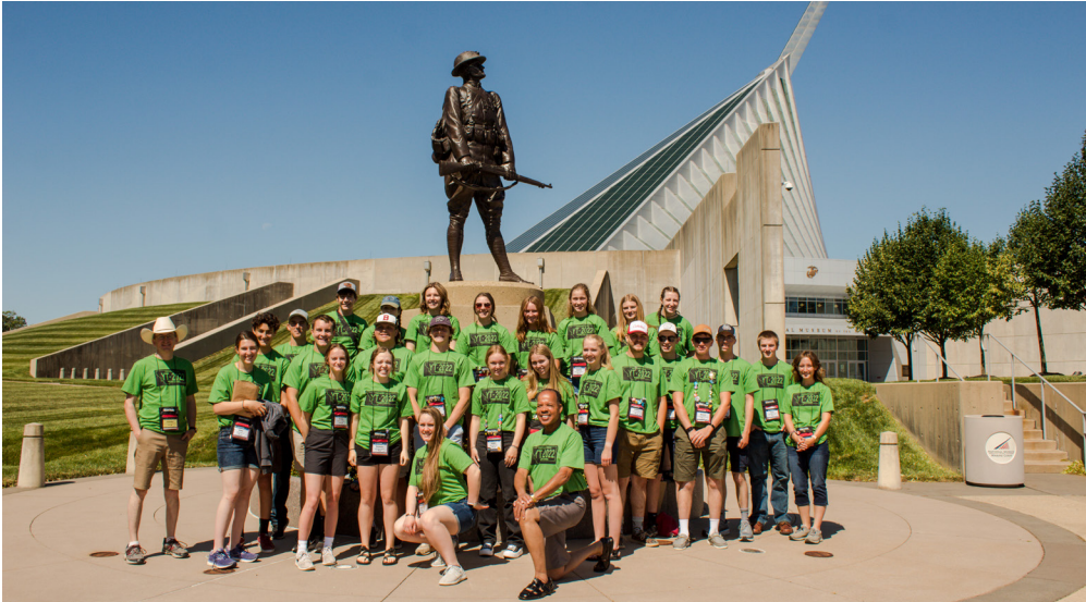
The 2022 Montana Youth Tour delegation poses at the Marine Corps Museum in Washington, D.C.