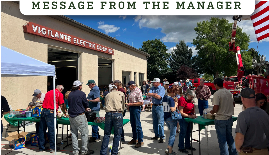
The "Brats and Kilowatts" Member Appreciation Day in Dillon in August was a hit.