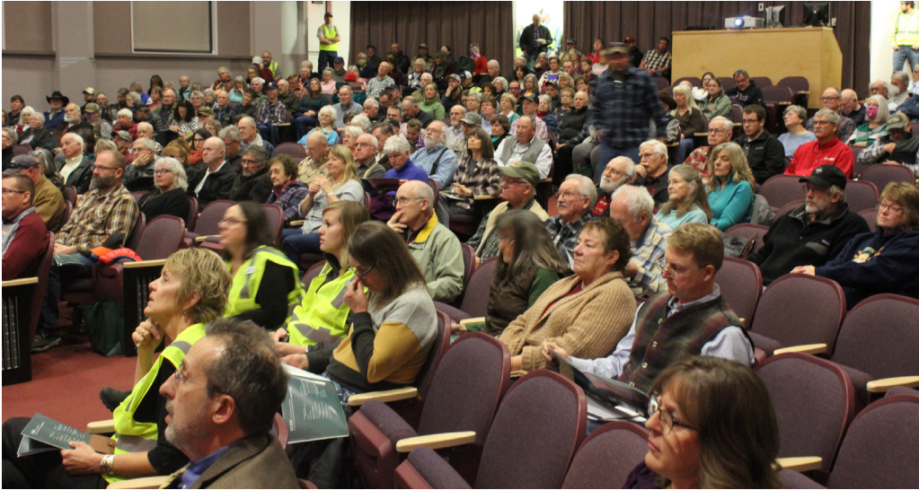
Vigilante Electric Cooperative's 85th Annual Meeting will be held on March 3 at the Watson Irrigation Training Center outside Townsend.