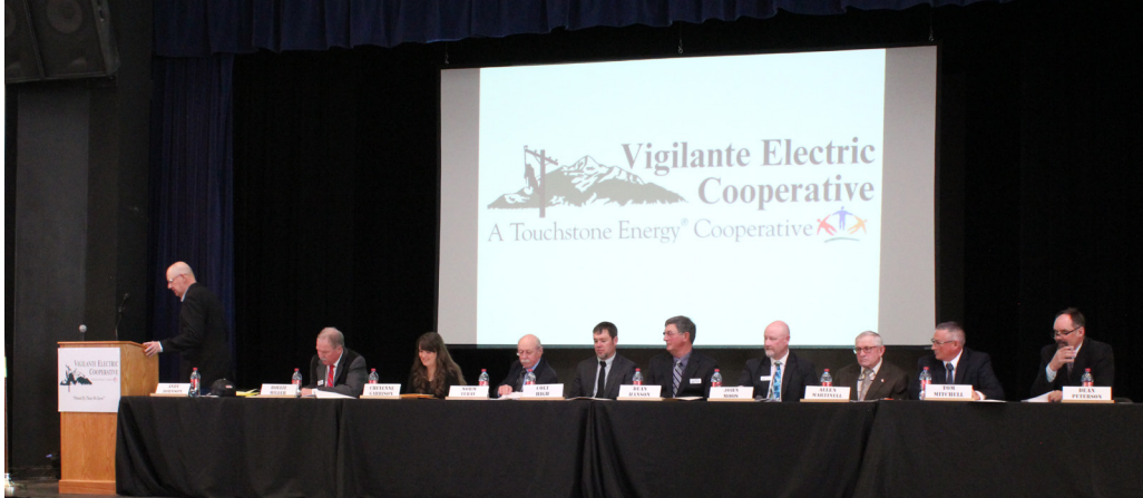
The Board of Trustees at the 2024 Vigilante Electric Cooperative Annual Meeting.